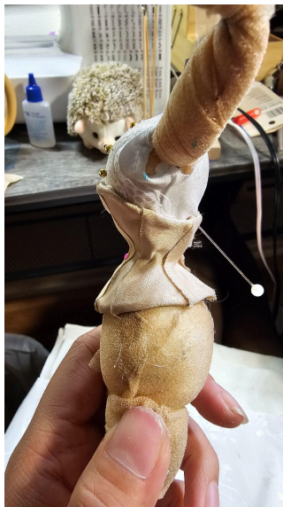
Foam build up on wire armature, made shirt waist out of fabric and made corset to her measurements. Pinned in place to hold so i can sew the skir