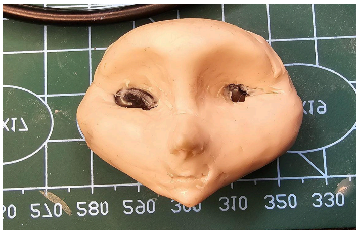
mid head sculpt